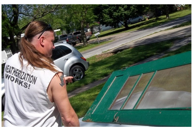
Doors and Windows are repaired or replaced