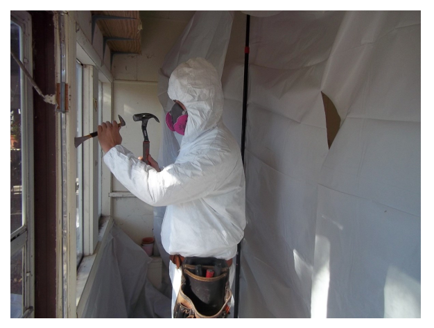
Tyvek suits are worn during safe work practices for windows with lead base paint

When the current weatherization grants are completed, the crew will move to the housing department to do rehab work.