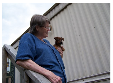
Two Satisfied Customers